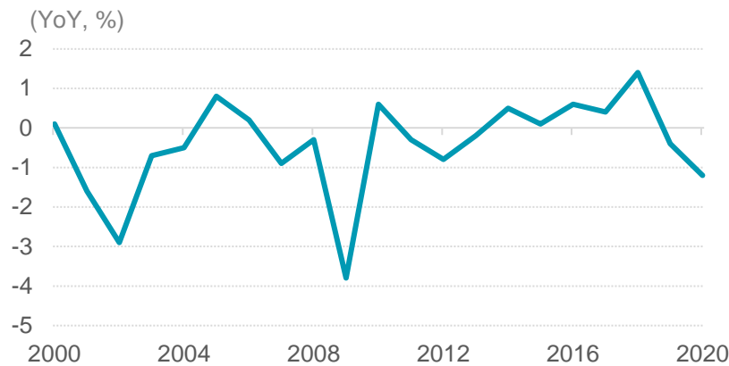
Fig.2. Wage Trends in Japan

What we can see is that Japanese companies have been reluctant to raise the price of their final products in line with higher costs, and are in fact absorbing the increasing costs. Of course, core CPI may lag corporate prices and is expected to rise. But the phenomenon of companies absorbing global inflationary pressures and deferring consumer prices has long been seen in Japan. Upward pressure on wages in Japan has been weak since the 2000s (Figure 2). If companies raise prices in such an environment, it will reduce the purchasing power of consumers and may dampen personal consumption. On the other hand, companies have sacrificed profits by giving priority to maintaining sales.