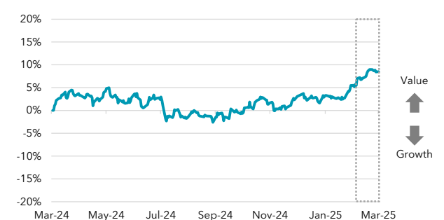
FIGURE 3. VALUE-GROWTH SPREAD

Note: The spread between the Russell/Nomura Value Index and the Growth Index (Positive figure means Value dominant)