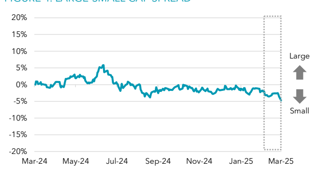
FIGURE 4. LARGE-SMALL CAP SPREAD

Note: The spread between the Russell/Nomura Large Cap Index and the Small Cap Index (Positive figure means Large Cap dominant)