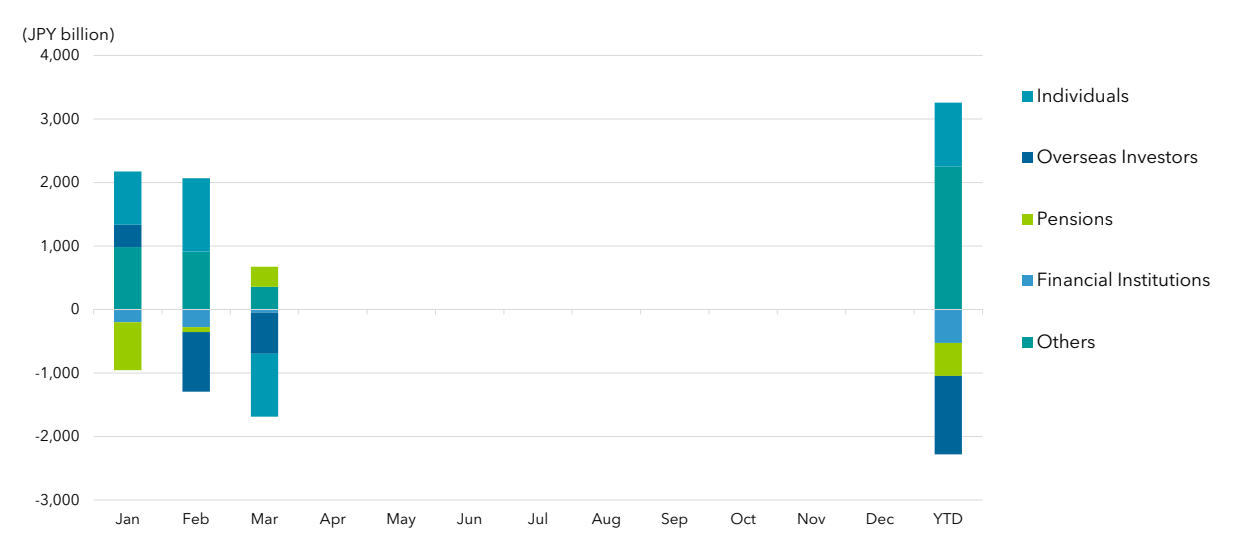
FIGURE 6. MONTHLY INVESTMENT ACTIVITIES BY INVESTOR TYPE IN THE JAPANESE EQUITY MARKET**