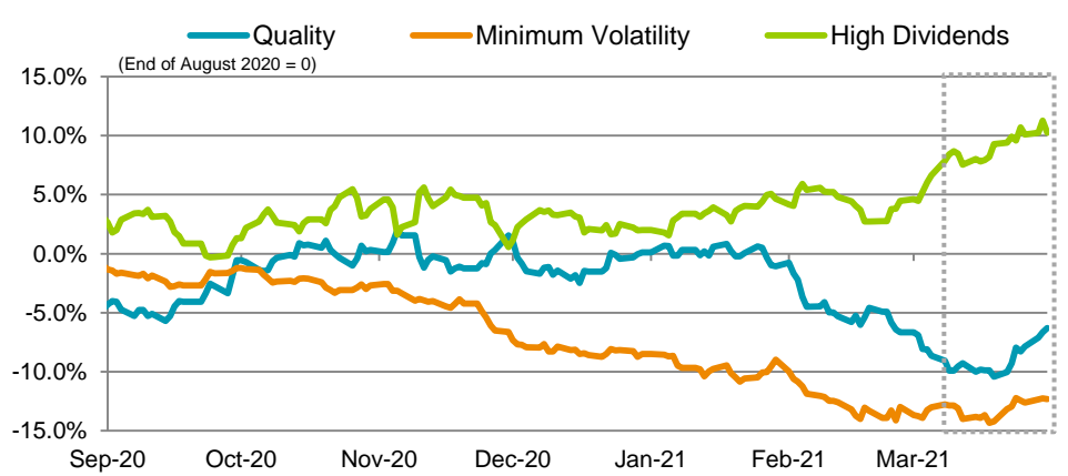
Figure 5. MSCI Japan Factor Indexes Spread against MSCI Japan

Data: Bloomberg, Nomura Securities, SuMi TRUST (as at the end of March 2021)