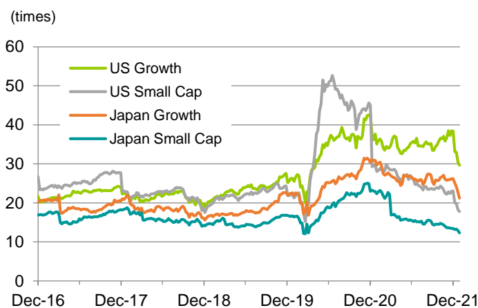
Figure 4. Japan/US indices Price to Earnings