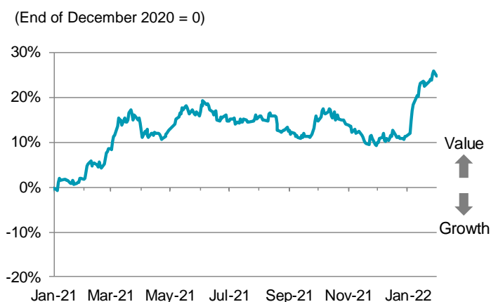
Figure 1. Style: Value-Growth Spread

The spread between the Russell/Nomura Value Index and the Growth Index (Positive figure means value dominant), as of 31st January 2022